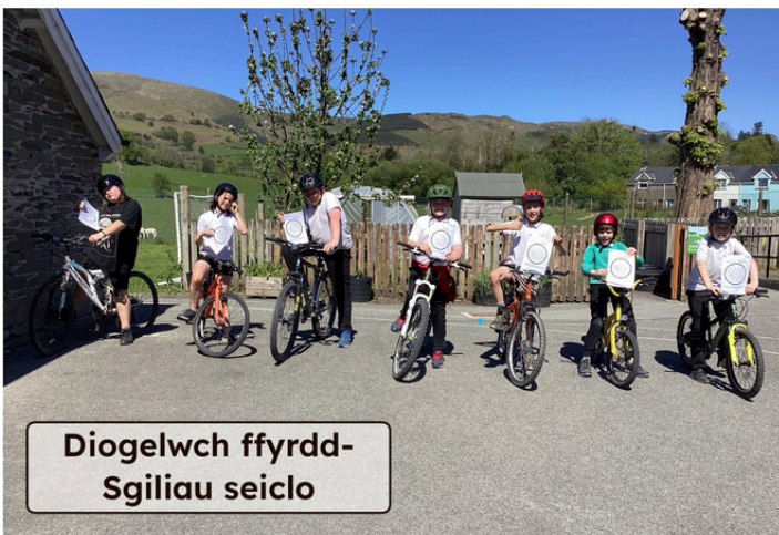
Diogelwch ffyrdd- Sgiliau seiclo